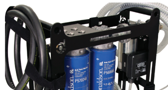
Powder coated heavy gauge steel frame