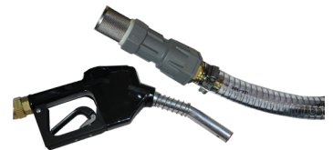
Hoses and fittings supplied