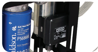
High quality 12 Volt Vane pump