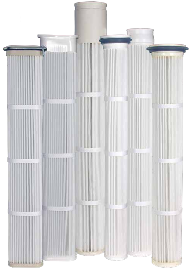
Ultra-Web SB Pleated Bag Filters

Available for all popular brands of baghouse collectors