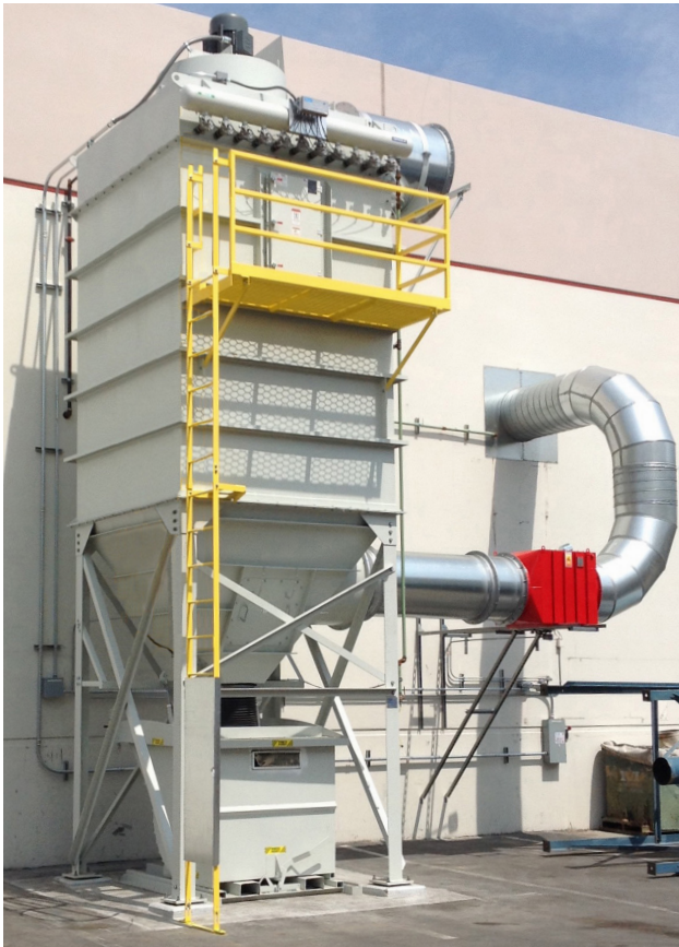
121FS8 Pulse Jet Baghouse Dust Collector with integrated fan, silencer and dumpster discharge