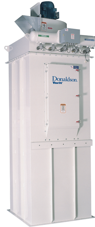
25FS8 Bin Vent with integrated fan

Economical solutions for dust collection and bin venting applications.