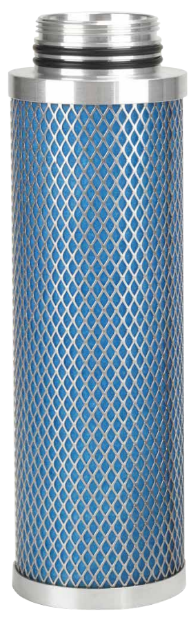
FFP, MFP, SMFP ULTRAPLEAT™