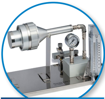
Bacterial colony test