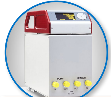
Particle size distribution

Evaluating the capability of a new filtration application requires a detailed analysis of existing conditions. With this measurement, we can determine the size and number of particles in your water based liquids. In addition, with our offer to analyze the water conditions in terms of water hardness, conductivity, pH value, and turbidity, we provide you the ideal complementary measures to design a new filtration system.