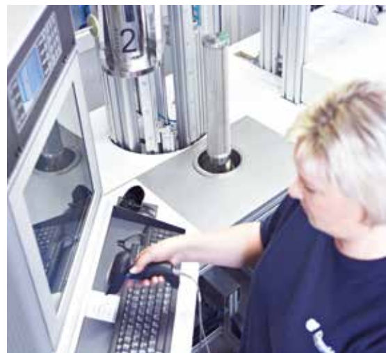
Donaldson offers a wide Range of Services

To enhance and complement our field services, highly sophisticated in-house laboratory services with highly sophisticated laboratory services are provided to validate oil aerosols, oil mist, particle size or concentrations.