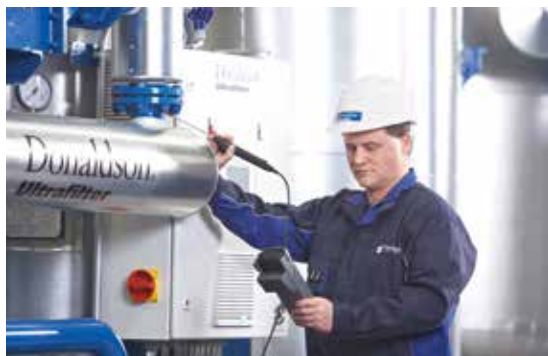
Preventative Maintenance avoids Emergency Calls

Donaldson's measurement technologies reliably determine your compressed air quality. Compressed air, dew point and residual oil are analysed. The air quality audit detects and precisely determines the oxygen, CO 2 and CO levels for special applications such as used for breathing air.