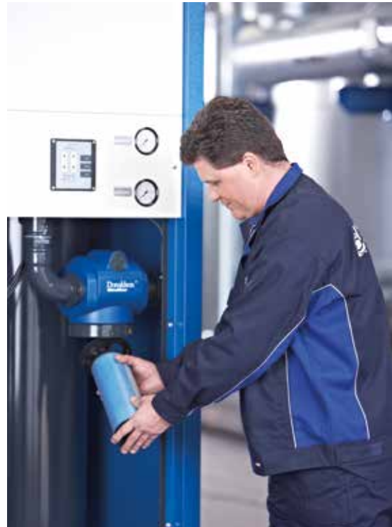
The Ultra-Filter Housing is easy to open in order to change the Filter Element

Donaldson provides services for all components of your compressed air system – the best selection of individual services or full service. Agreements comprising of different maintenance offerings tailored to fit your needs and requirements.