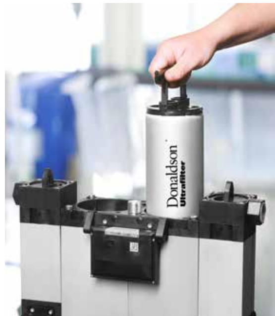
Clean and easy Exchange of the Cartridges