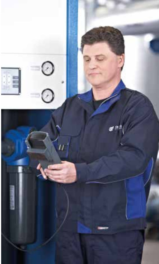
Total Filtration Service for Compressed Air