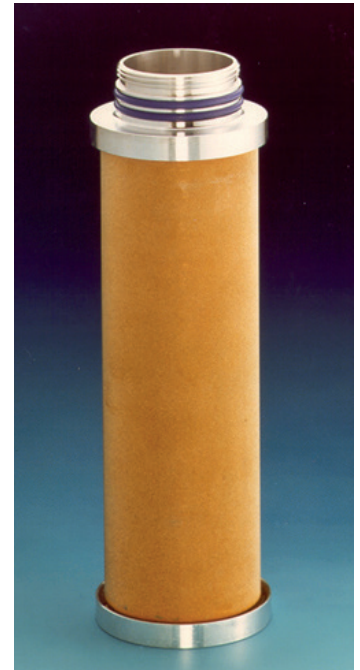
Depth filter SB