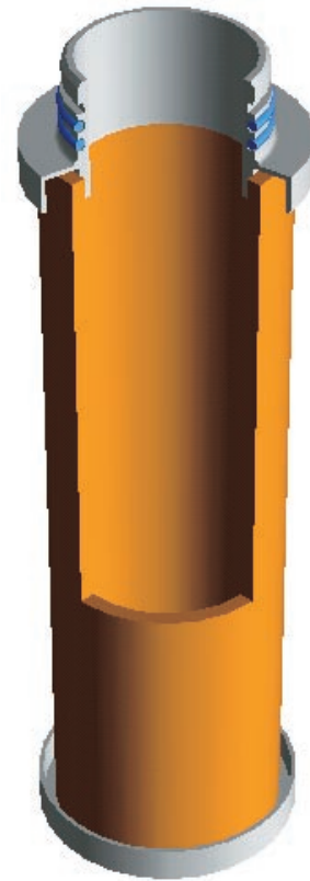
Cross section of the depth filter

The high-grade sinter bronze medium guarantees not only a high load of contaminants but also the regeneration of the filter element.