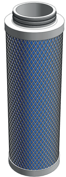
Depth Filter UltraPleat® MF