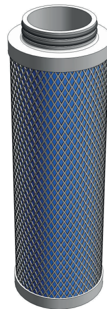
Depth Filter UltraPleat® FFP