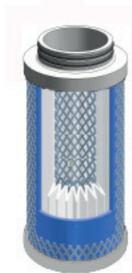
Cross section of the depth filter

By utilising various filtration mechanisms such as retention by direct impact, sieve effect and diffusion effect, liquid aerosols and solid particles down to the size of 0.01µm are being retained in the filter.