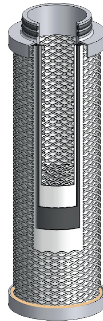
Cross section of the depth filter AK

The specified performance data for the achievement of the compressed air quality classes according to ISO 8573-1 were validated according to ISO 12500-2.